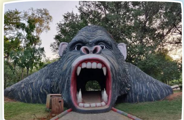
Murugha Vana - 3.8 Kms