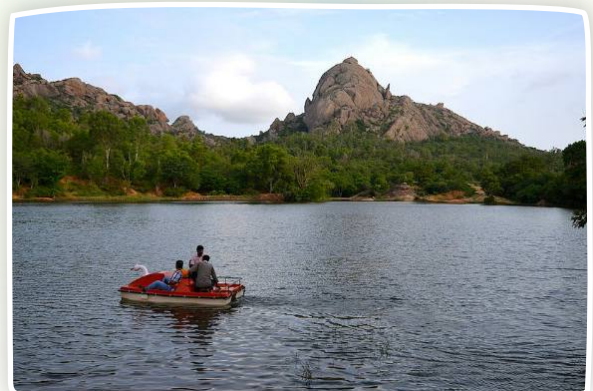
Chandravalli Caves - 6.3 Kms