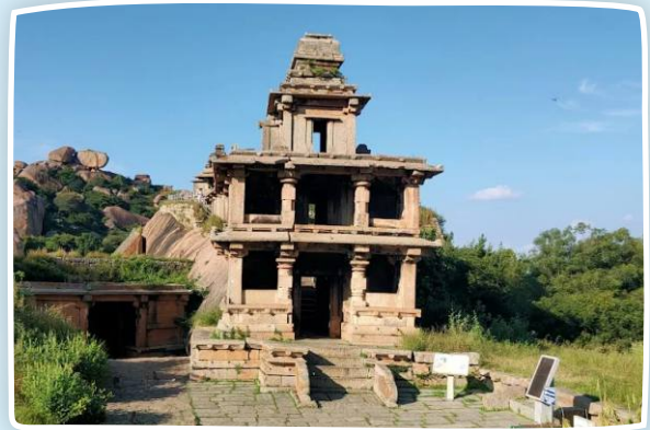
Sri Hidambeswara Gudi - 5.3 Kms