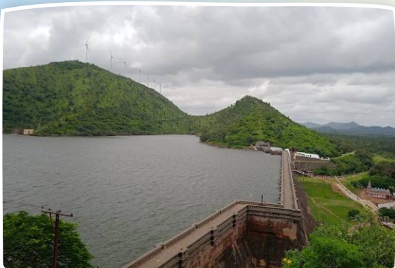
Vani Vilasapura Dam - 58.8 Kms